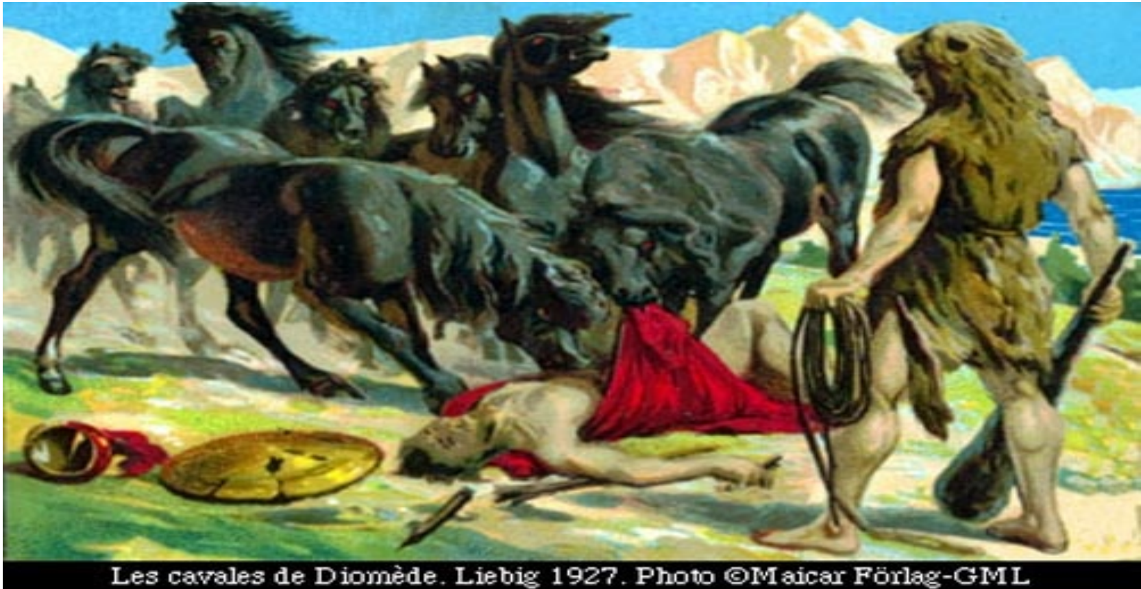
Les cavales de Diomède. Liebig 1927.